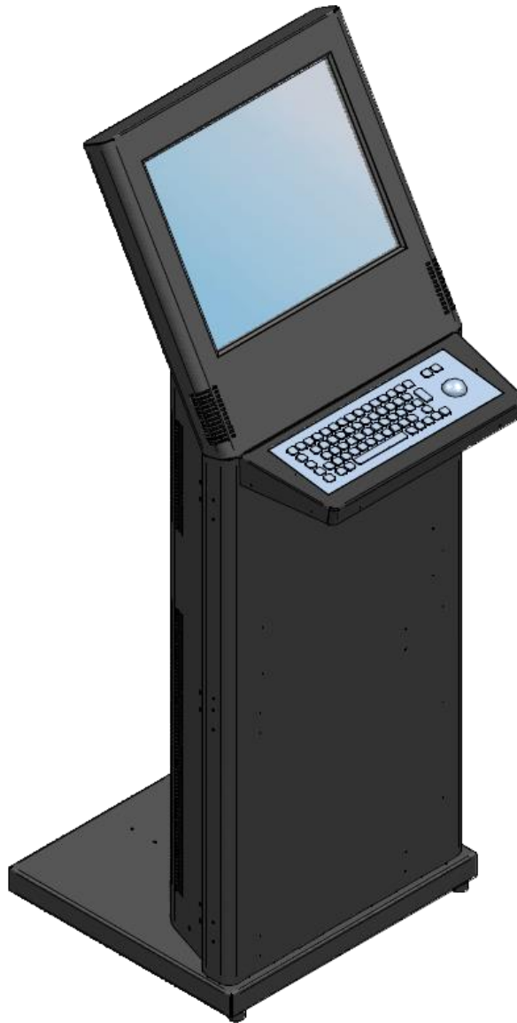
w/ keyboard & w/o bcr shelf kit