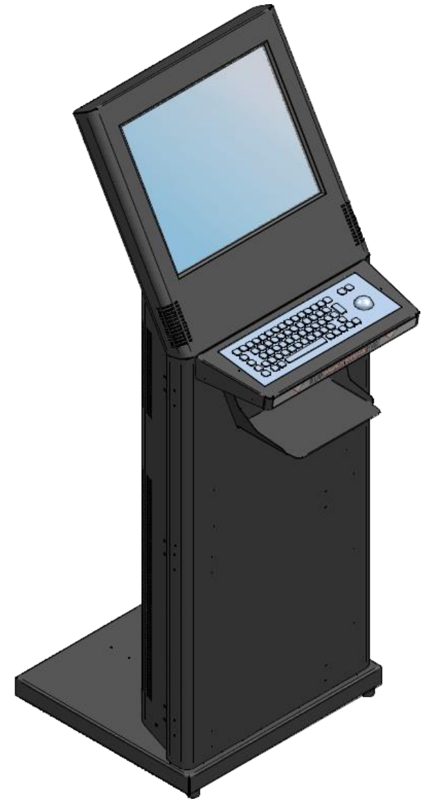
w/ keyboard & bcr shelf kit