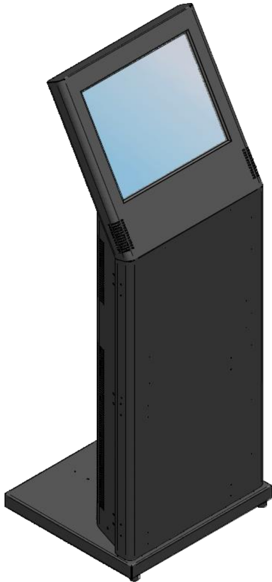
w/o keyboard & bcr shelf kit