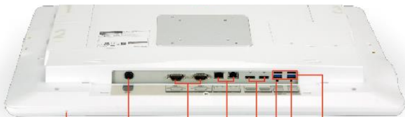
Digital microphone 19V DC Jack RS-232/422/485 GbE LAN AT/ATX HDMI USB 3.0